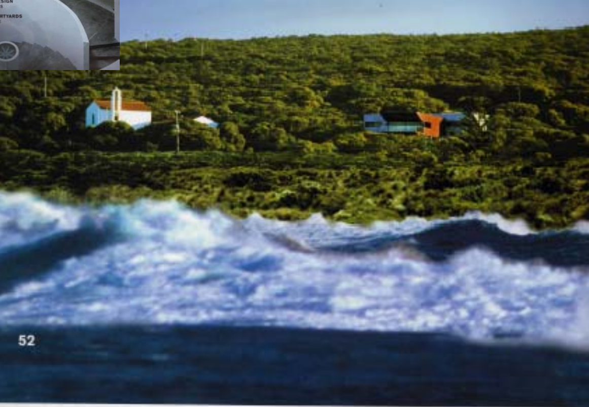
MOVE YEW OF SOUTH WESTERN RICKSE, RELIGIT TOP: YES PROMOREDONS TO NORTH, GROW RETTOM YES FROM EXCREME TOWARD

>> feight. The view from the bedrooms affords a voyeunatic gimpse back into the front room — these are not simply places of autitude and retirest they expects guests, excess.